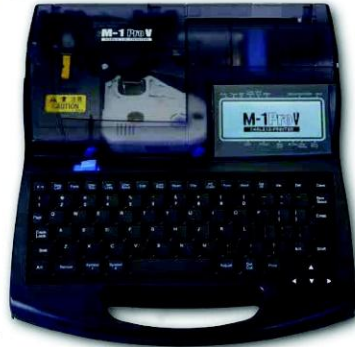
CABLE ID PRINTER M-1 ProV